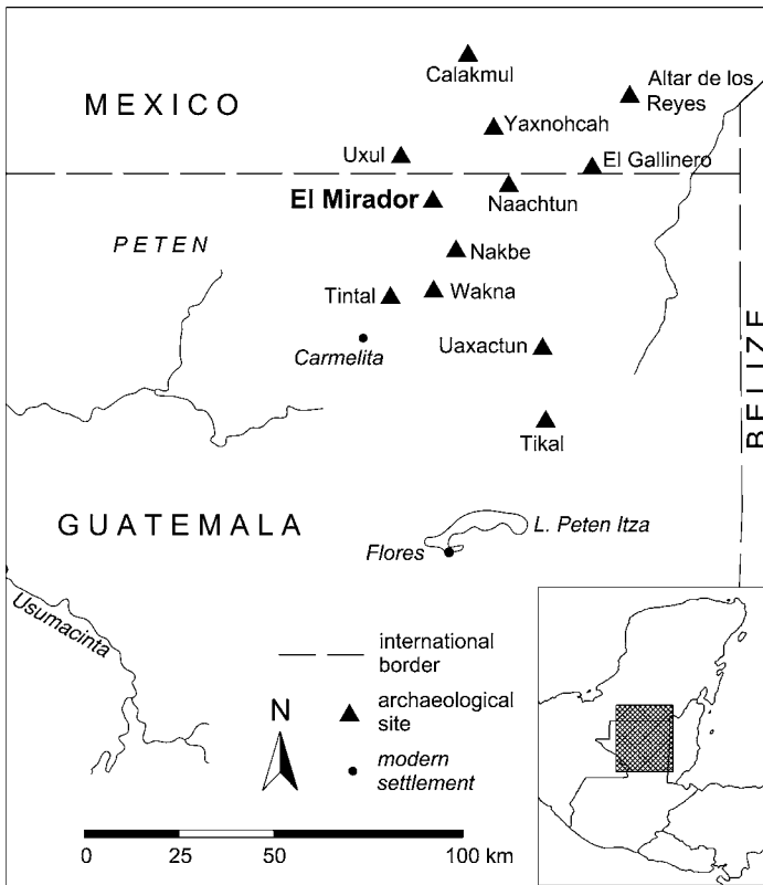
Figure 1: Location of El Mirador and some other major archaeological sites in the central Maya Lowlands

Most buildings of El Mirador are earthen and stone mounds covered by dense tropical vegetation; their sizes, irregular shapes and vegetative cover do not allow architectural orientations to be easily determined and the alignments in urban layout to be detected and measured in the field. However, the recently elaborated site map based on total-station surveying (Hansen et al. 2006; Morales-Aguilar and Morales López 2005) is sufficiently accurate for archaeoastronomical considerations. In order to obtain true (astronomical) azimuths necessary for this type of research, the map's orientation has been rectified to true north: during field measurements in 2007, theodolite readings were taken along several long sight lines connecting points easily and accurately identifiable on the map, employing astronomical fix and methods described elsewhere (e.g.: Aveni 2001: 120–124; Ruggles 1999: 164–171).