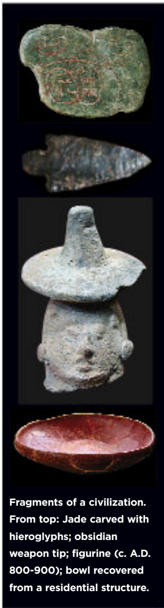
Fragments of a civilization. From top: Jade carved with hieroglyphs; obsidian weapon tip; figurine (c. A.D. 800-900); bowl recovered from a residential structure.