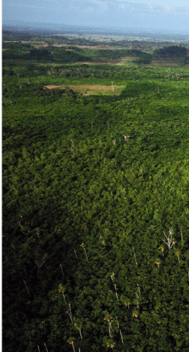
Above: logging and cattle ranching, at right, threatens the Mirador basin. Says Hansen: “Any use of this particular area of forest other than [for] ecotourism would be, to me, the equivalent of using the Grand Canyon for a garbage dump.”

ed platform of cut stone and rock fill that was some 980 feet wide and 2,000 feet long and covered nearly 45 acres.